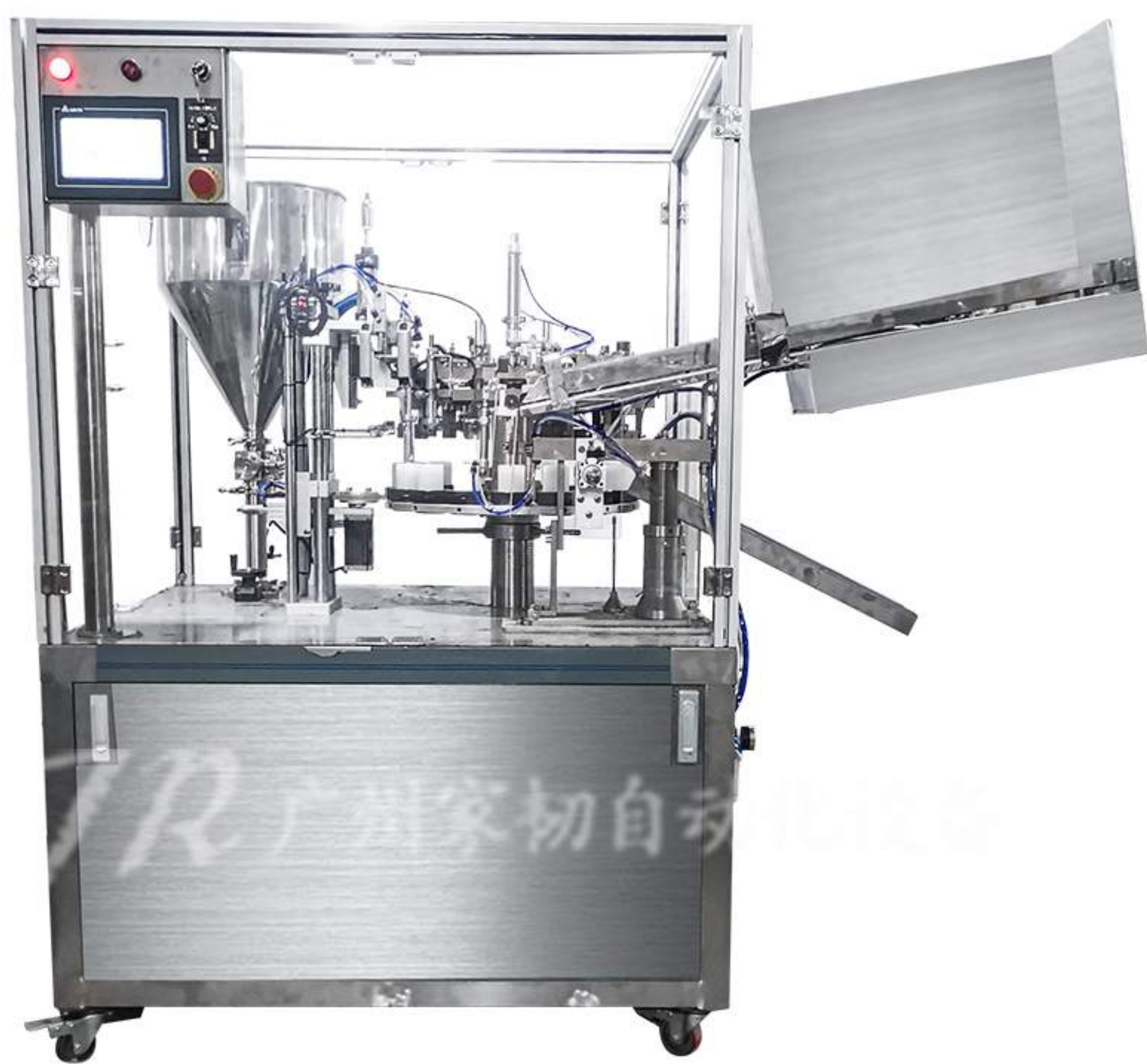
Automatic aluminum tube filling and sealing machine