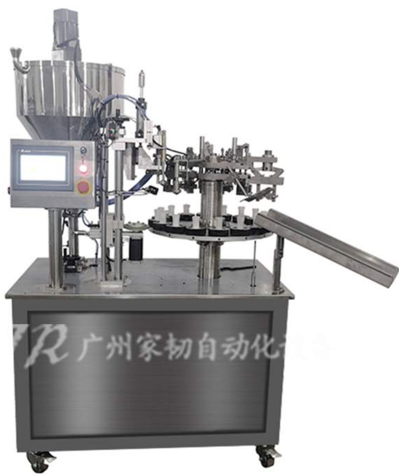
Aluminum tube filling and sealing machine