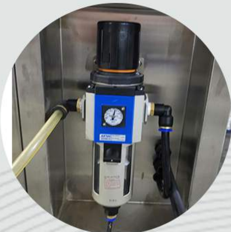
ADJUSTABLE AIR VALVE