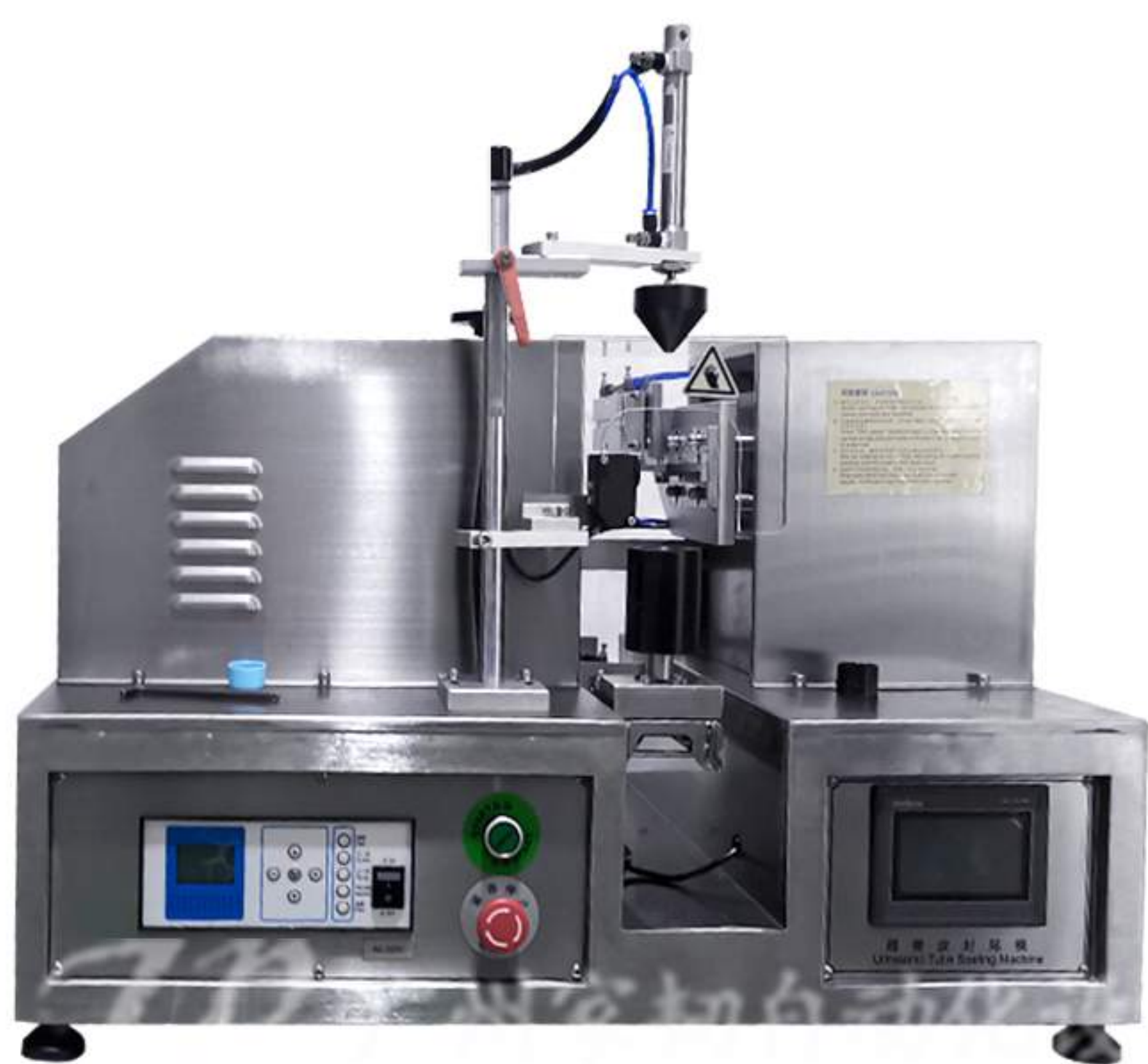
Ultrasonic tail sealing machine