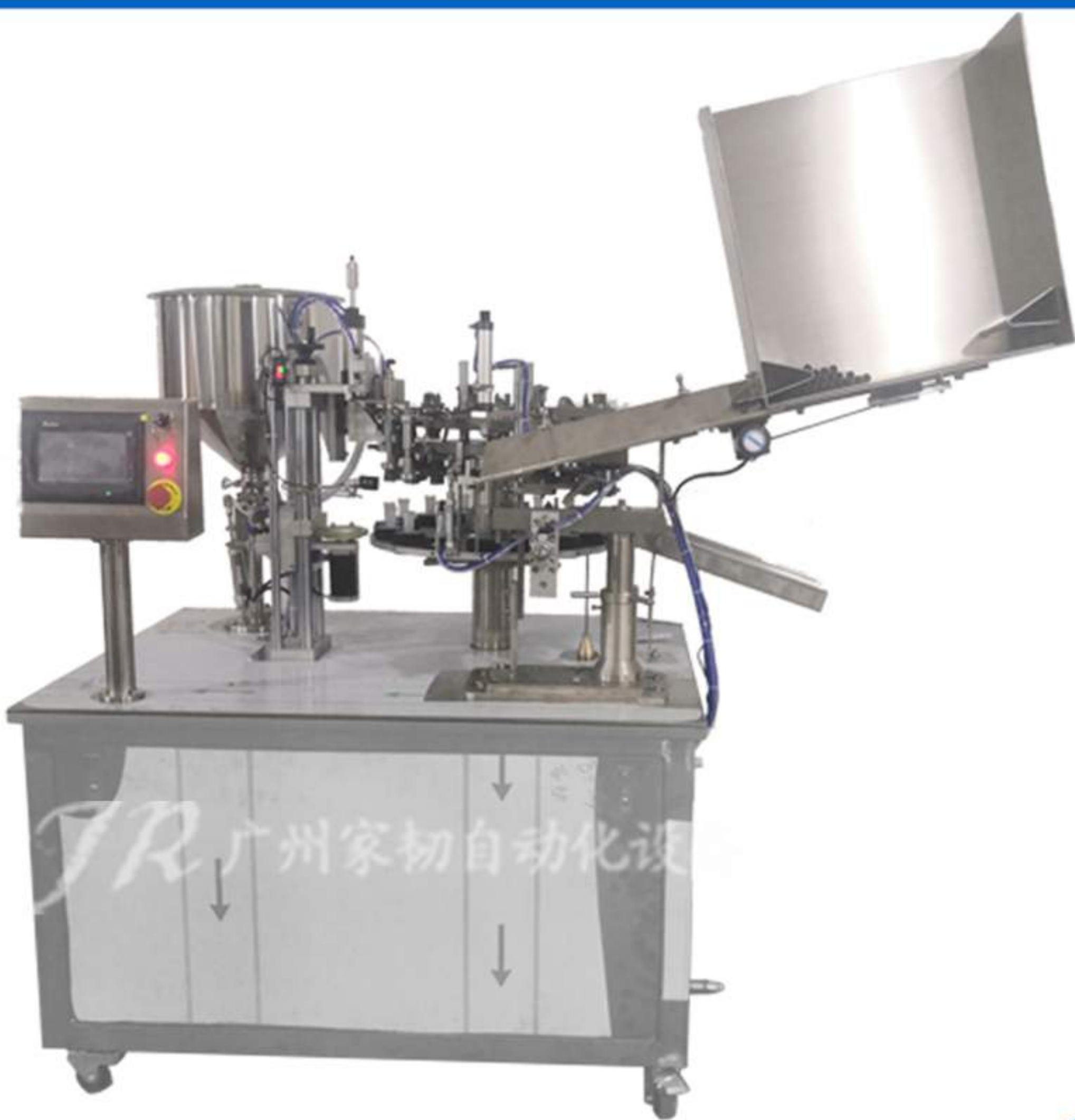
Automatic aluminum tube filling and sealing machine