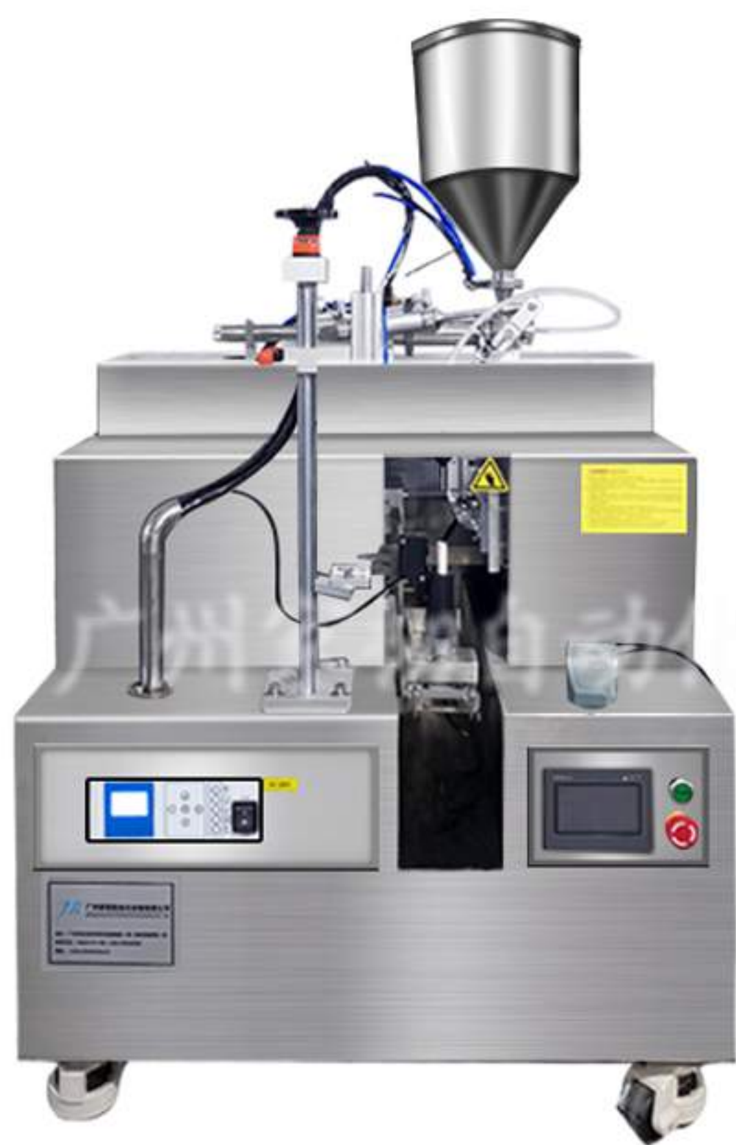
Ultrasonic filling and sealing machine