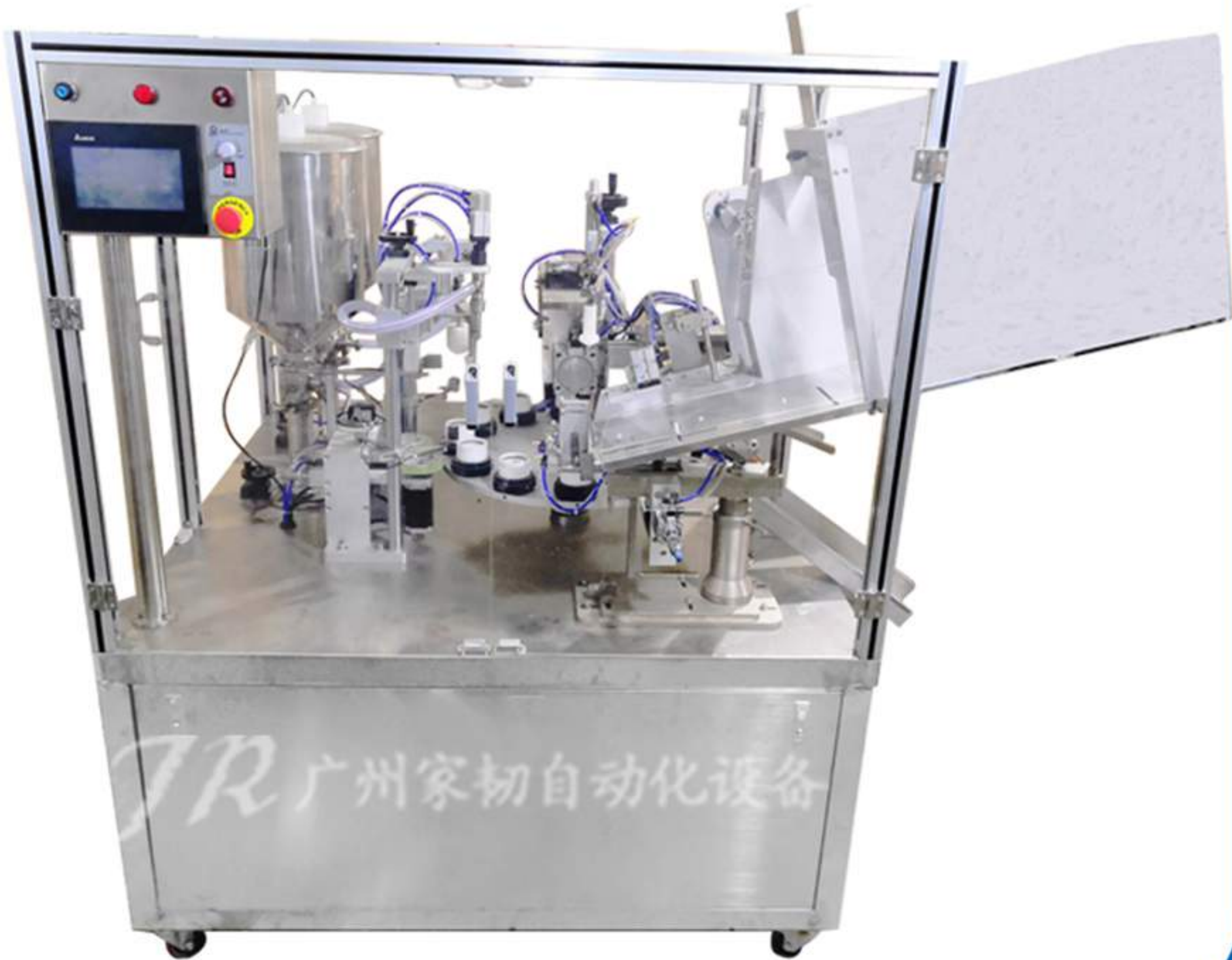
Fully automatic double tube filling and sealing machine