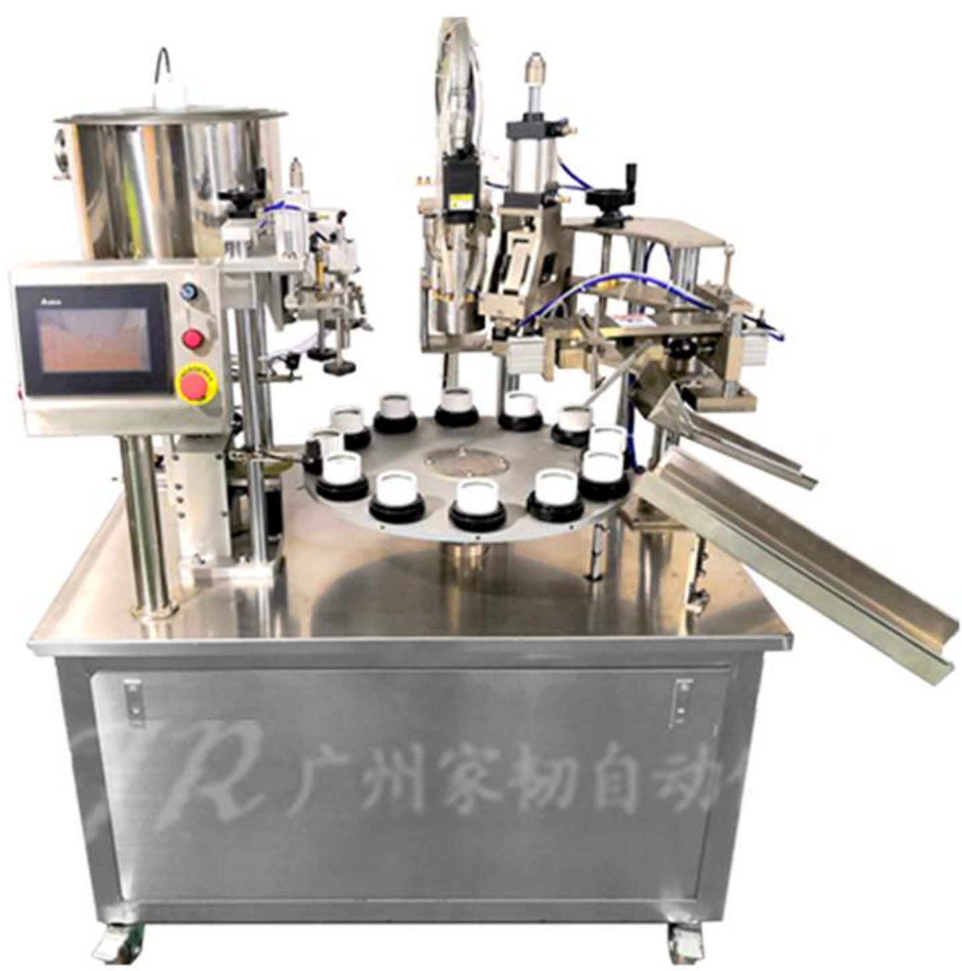
Tube filling and sealing machine