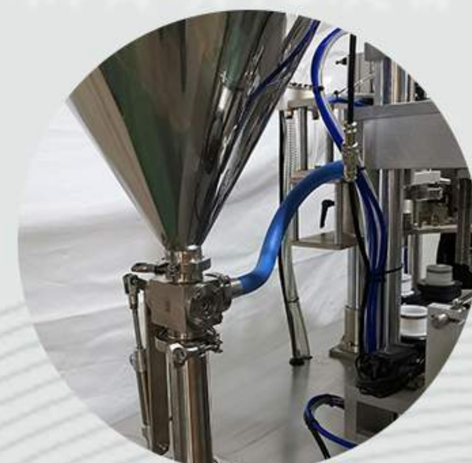
THE CLAMP DESIGN