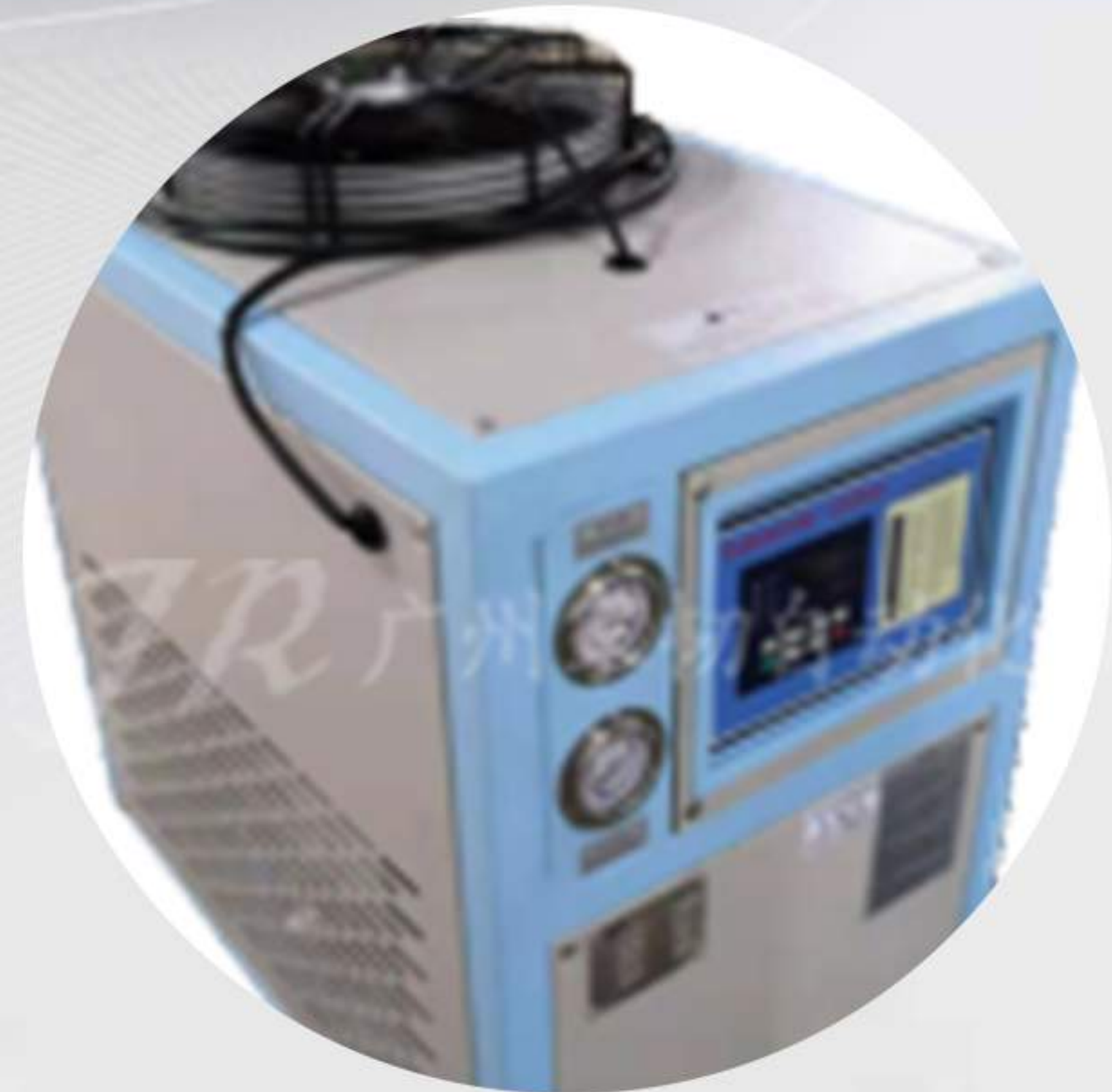
COLD WATER MACHINE