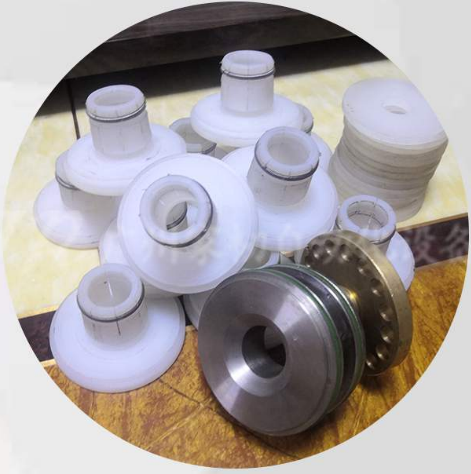
SEALING MOLD AND TUBE HOLDER