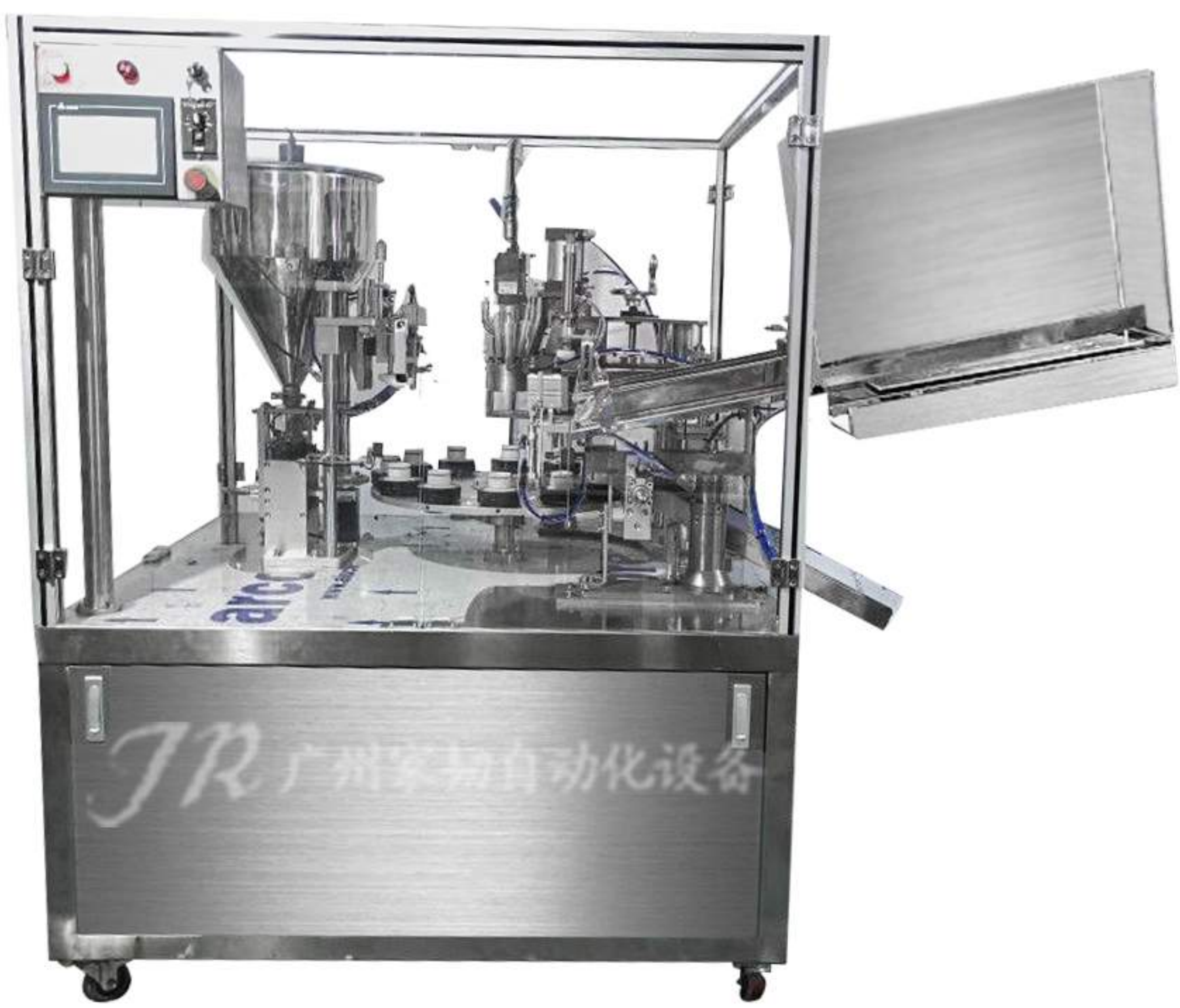
Automatic tube filling and sealing machine