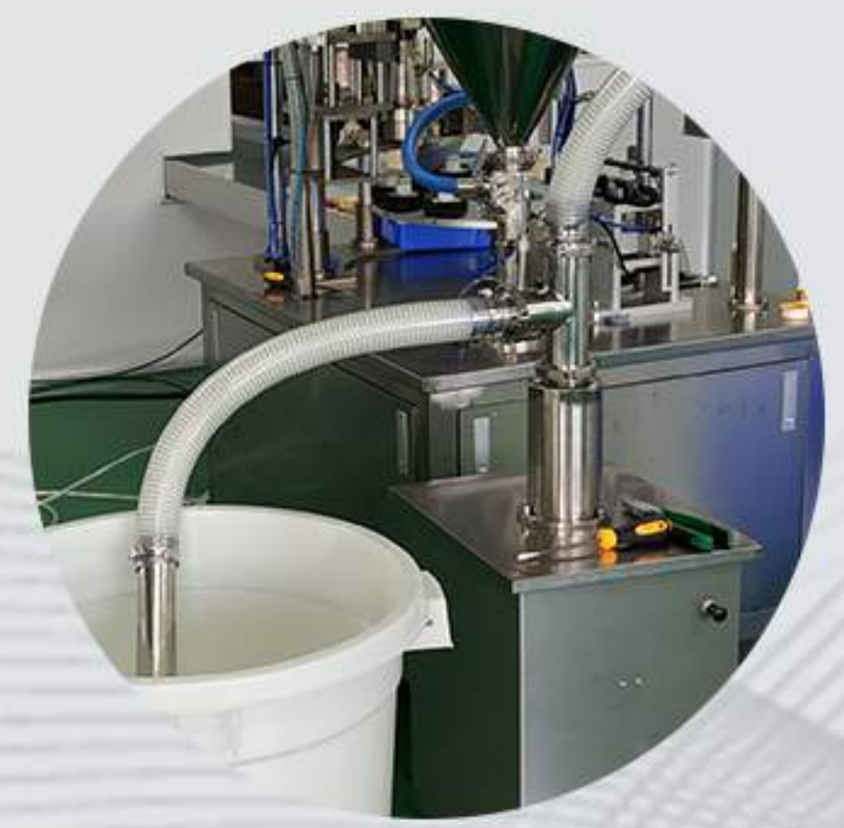
THE LOADING SYSTEM