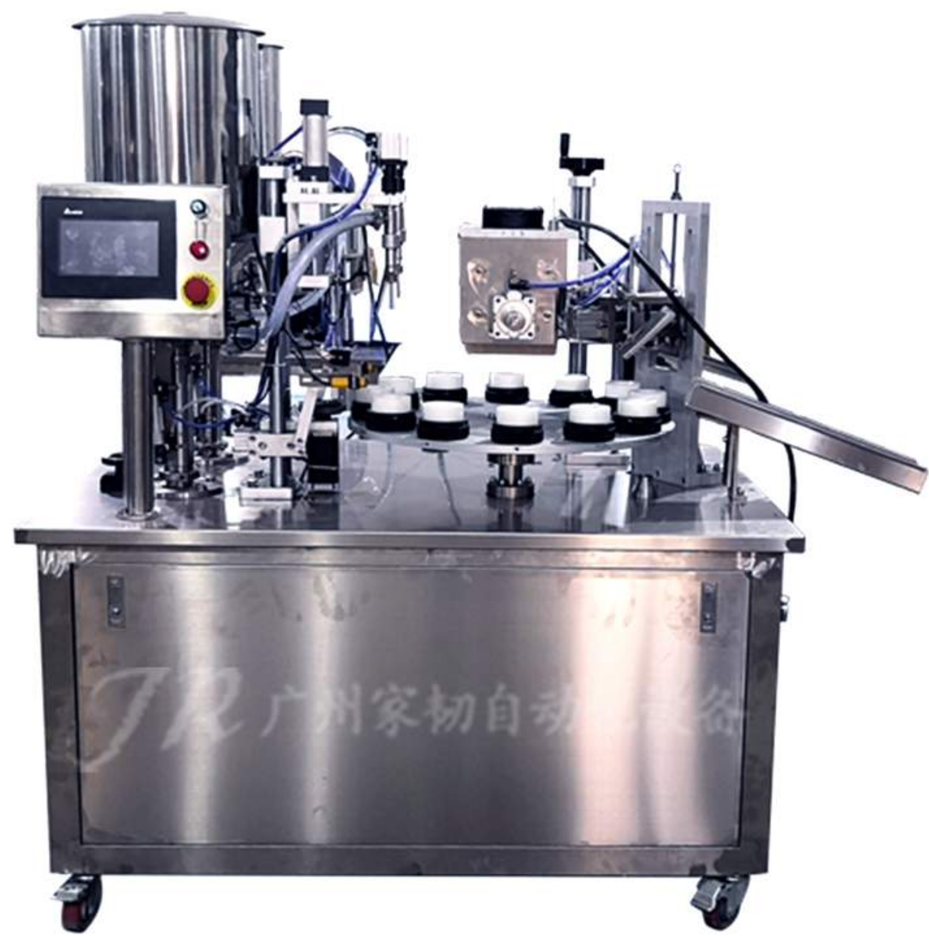
Semi-automatic double tube filling and sealing machine